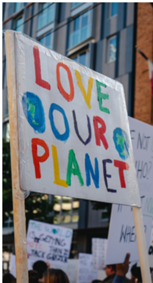
Photo 'Love our planet signage' by Ronan Furuta @ Unsplash ( https://unsplash.com/photos/sp_pcgiPxg1 )

The remainder of this report presents the route to achieving these objectives and the key project outcomes. The next section provides an account of the methodological approach we pursued to achieve these goals. This is followed by an explanation of the principal findings of the project, namely the Sustainability Content Evaluation Tool and Critical Sustainability Stories (CriSS) Tool which was designed to support communicators in the development of sustainability and climate change stories and creative content. Guidance notes on how to use and implement the CriSS Tool are available to communicators as an accompanying document to this report.