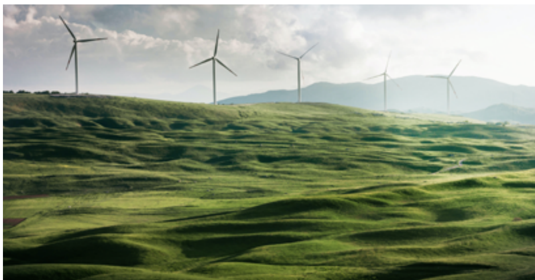
Photo "Valley of windmills" by Appolinary Kalashnikova @ Unsplash ( https://unsplash.com/photos/WYGhTLym344 )

We tested the utility of the CriSS Tool within a one-day workshop with 26 delegates